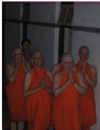
After the dip in the river – coming back to save the world